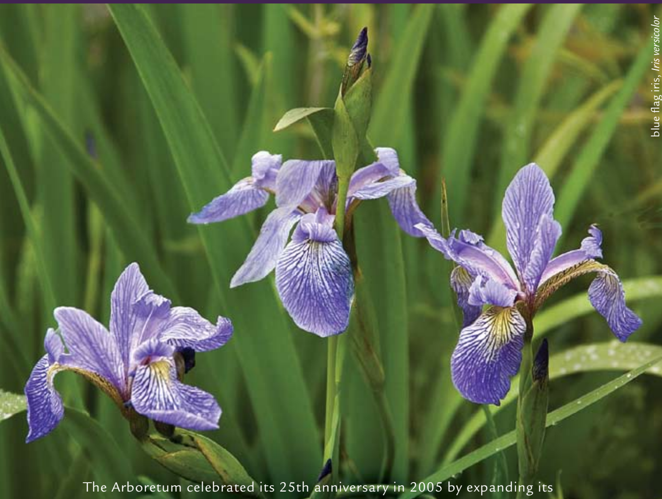
blue flag iris, Iris versicolor

The Arboretum celebrated its 25th anniversary in 2005 by expanding its programs to strengthen the connection between its mission—teaching an appreciation of the flora native to our region—and its changing and growing community. It is through these connections that the Arboretum continues to grow and flourish.